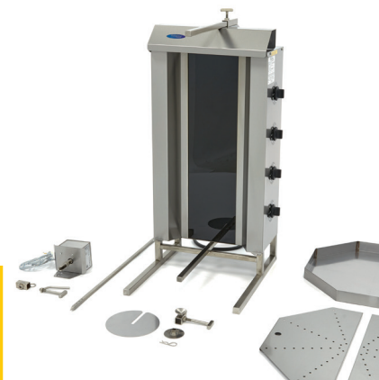
Easy to dismantle and clean