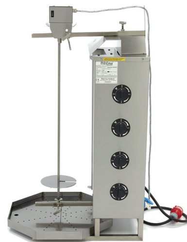
With adjustable skewer for perfect preparation.