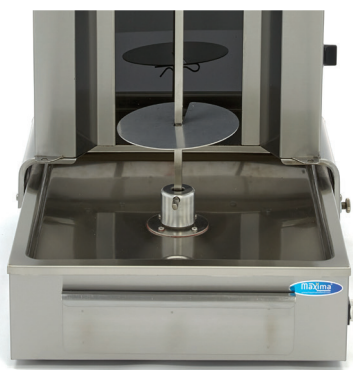
Stainless steel doner grill equipped with drip tray