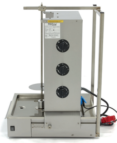
With adjustable skewer and burners for perfect preparation