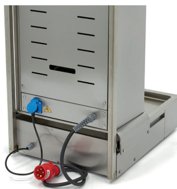
Electric cable on backside