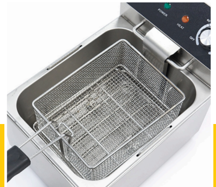
Protected heating elements and adjustable thermostat