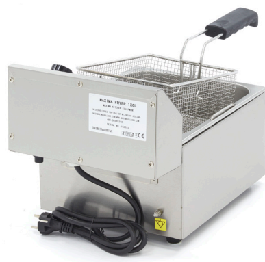
Completely made of stainless steel