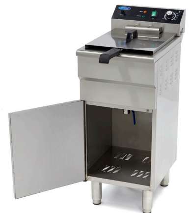
Protected heating elements and adjustable thermostat