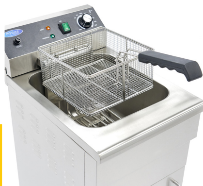
Completely made of stainless steel, with oil valve