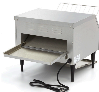
Stands on four adjustable legs