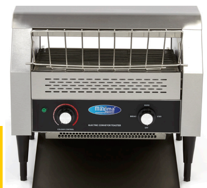
Easy to operate toaster