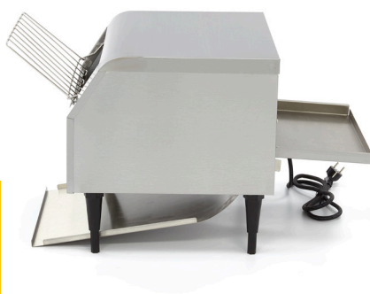
Stainless steel housing with grille and slide