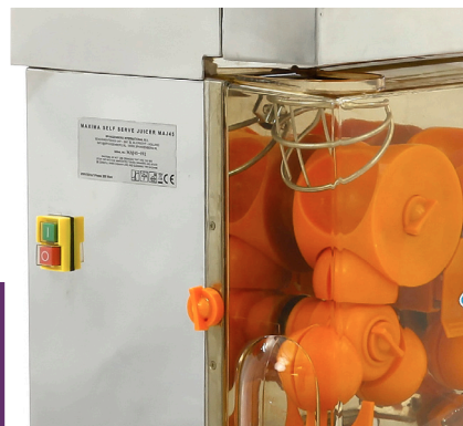
Anticorrosive press parts and on-off switch on the side