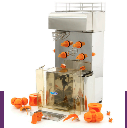
Easy to dismantle and clean