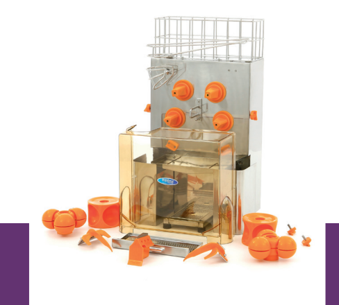
Anticorrosive press parts and on-off switch on the side