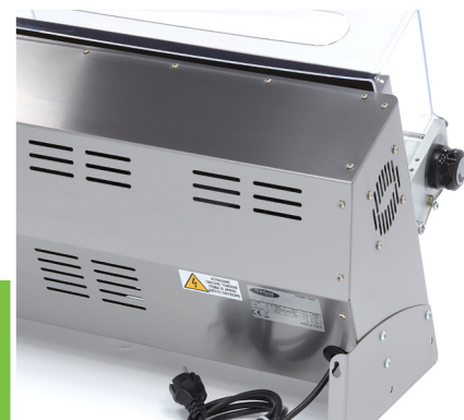
Durable and powerful drive which does not heat the dough