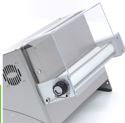
Rolling pin adjustable with simple knob