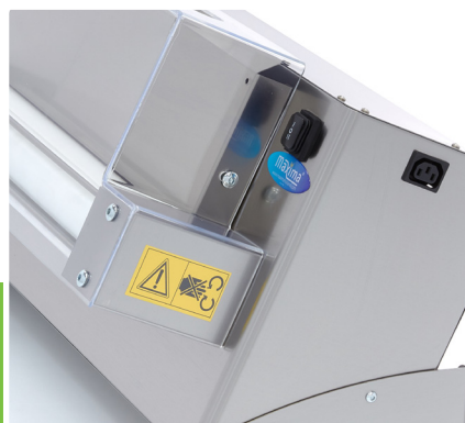
Suitable for: Fondant, Pizza -, Pasta -, Bread - & Cake Dough