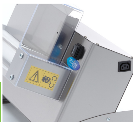
Suitable for: Pizza -, Pasta -, Bread - & Cake Dough