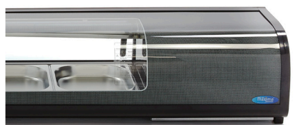
Dixell digital temperature controller