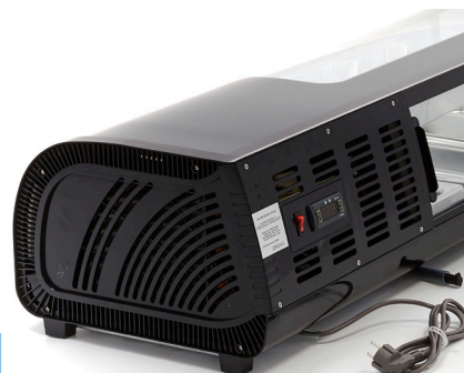
Cooling system with fan