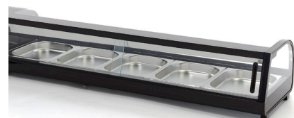
Stainless steel housing & inside