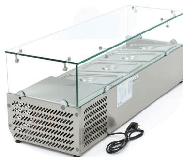
Static cooling with foamed evaporator