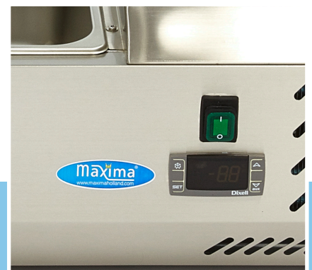
Dixell digital temperature controller