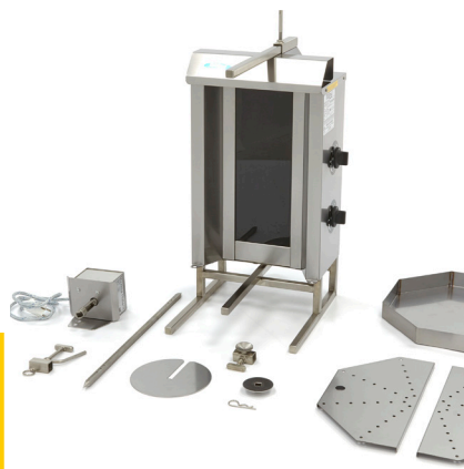
Easy to dismantle and clean