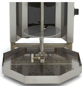
Stainless steel doner grill equipped with drip tray