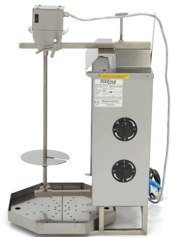
With adjustable skewer for perfect preparation.