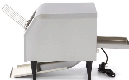
Stainless steel housing with grille and slide