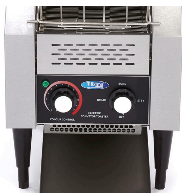
Easy to operate toaster