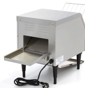
Stands on four adjustable legs